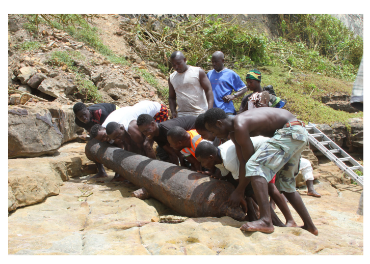
Figure 3: Moving the cannon.

Within the castle walls, the survey focused on the entire area, excluding the castle building's offices since still in government use. The entrance to an underground tunnel on the west side of the castle, first noted in 2006, was also explored revealing it has been blocked. The residential area to the east side, including the swimming pool