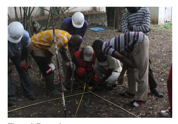
Figure 4: Excavations.

the first scholar granted access to conduct the first archaeological excavacation at the site. Work continued in 2016 and 2017, after meetings between the Chiefs, Queen Mothers, elders, principal investigator and community to discuss the project, whereupon the Osu Traditional Authorities assigned ritual specialists to perform the necessary rituals to ensure project success. In total, archaeological work involved the excavation of eight units during the period of 2014-2017. Three units will be discussed here. Excavation followed 10 cm layer increments; to retrieve as much material as possible, soil was sieved with a 3mm wire mesh. All material was examined and soil and charcoal samples were collected. It is important to note that the area immediately next to the shrine was not excavated for ethical reasons.