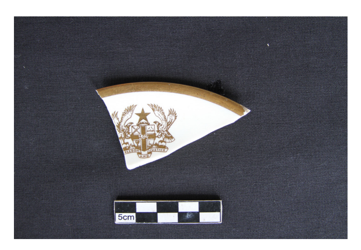
Figure 5: Presidential Ceramics.

In addition to the archaeological survey and excavation, other factors contributed to the creation of the artifact collection. In 2014, a large collection of 'Western style' objects was salvaged from the kitchen, pantry and chef's living quarters, notably: ceramic tea and coffee cups, saucers, plates and a cake serving dish; crystal glassware, including champagne flutes, brandy, wine and water glasses; and mostly, silver cutlery. Ceramics and glassware date to Ghana's post-independence period, inscribed with the Ghana Coat of Arms, inside which Christiansborg castle, renamed 'Osu Castle' is depicted, and also bearing the national motto 'freedom and justice', designed by Ghanaian artist Amon Kotei. Ceramics date to the Nkrumah and Rawlings eras, encompassing a multicolored design and gold design (Figure 5). Other presidential ware is blue and gold in color. British manufacturers Wedgwood and Royal Doulton are predominantly featured. In 2016, a large teapot, teapot lid from another item, and soup tureen were retrieved. The latter, red, white and gold in color, was still in use, albeit not known by whom, but in all likelihood a castle employee. All these artifacts are similarly reflected in the excavated artifact collection.