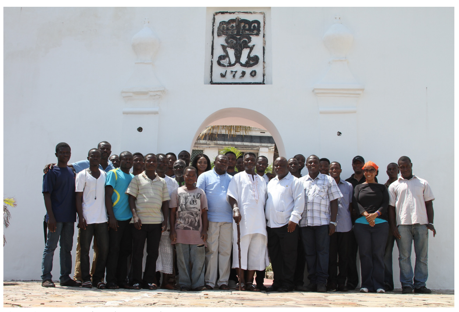
Figure 6: Osu Community and Team Members.